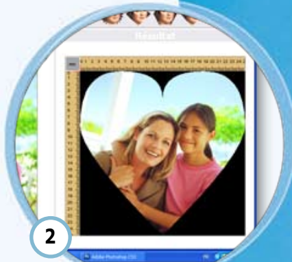
Import and position the photo in the template