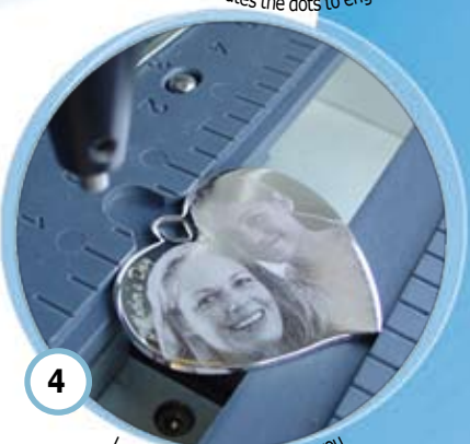
Let the machine engrave for you