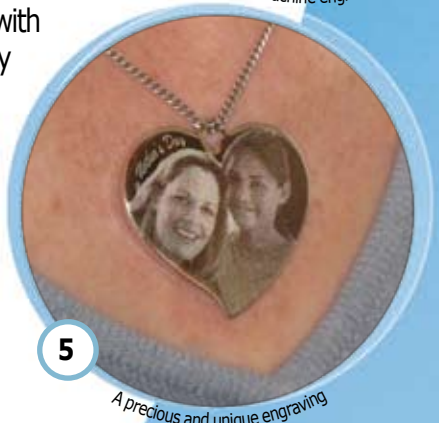
A precious and unique engraving